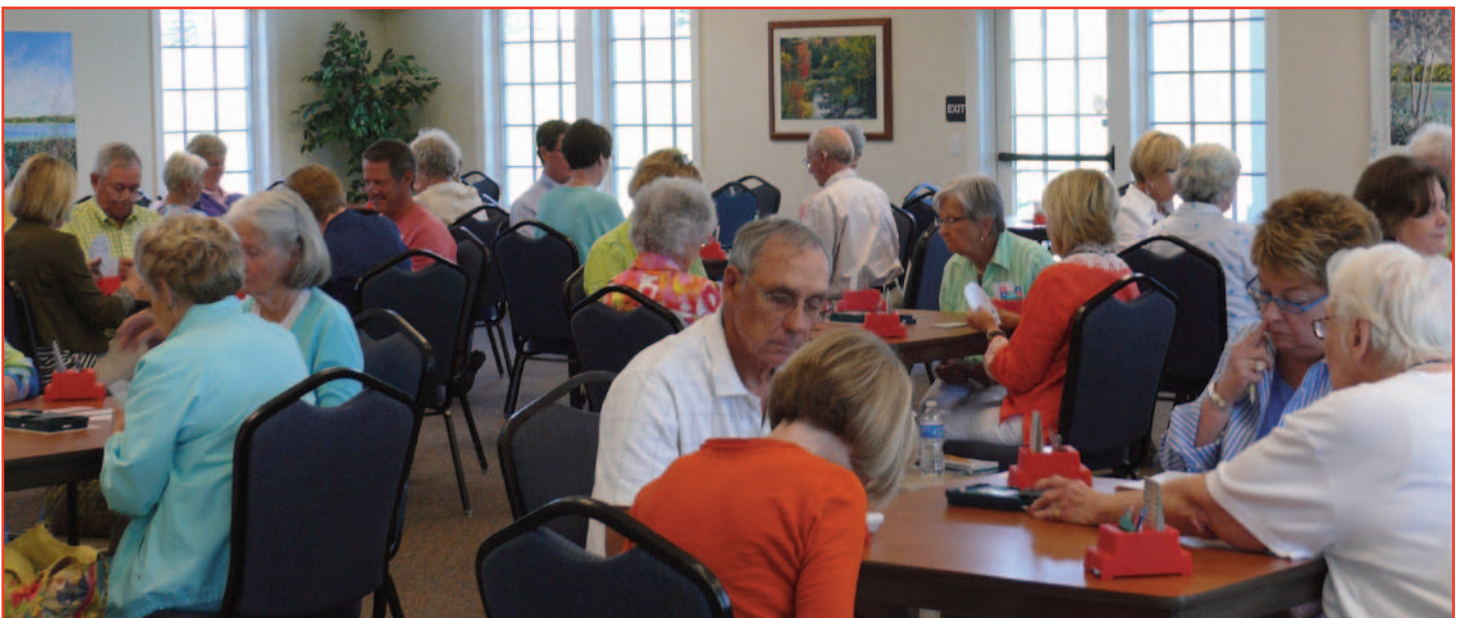
A Tuesday game at the Bridge Center.

As you all know, we have our Novice/Intermediate games on Tuesday and Friday. Players who have less than 200 masterpoints are encouraged to join us for a relaxed, fun, yet competitive game. We talk, we learn, and we become more confident with our game as we prepare to jump into the Open games on Wednesday, Thursday and Sunday. You can tell it's enjoyable as this year in May/June/July we've had 25% more players per game than we did in 2011. Pass the word about these opportunities to play bridge to your friends and guests who may be slightly intimidated by the thought of playing against experts or haven't yet experienced the world of Duplicate Bridge! See you there!