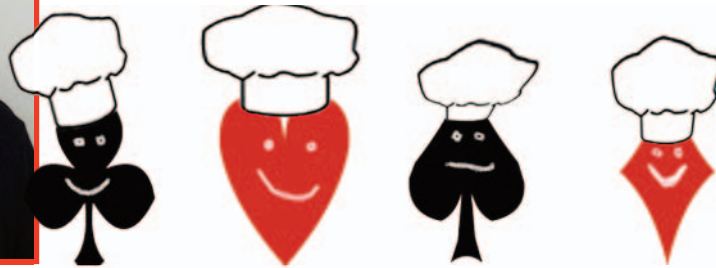
The Petoskey Bridge Club is publishing a cookbook! Yes, it's true! After all the years of eating your delicious treats, we have decided to rollout a cookbook in May/June 2013. And we need your help!